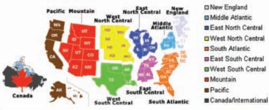
Map of the United States by Regions and Canada