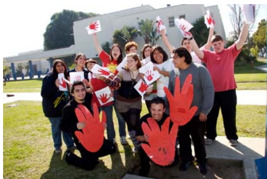
Students in California made 531 red hands to send to their congressional representative.

For more information about child soldiers, visit the Coalition to Stop the Use of Child Soldiers at www.child-soldiers.org .