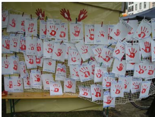
Red hands on display in Germany.