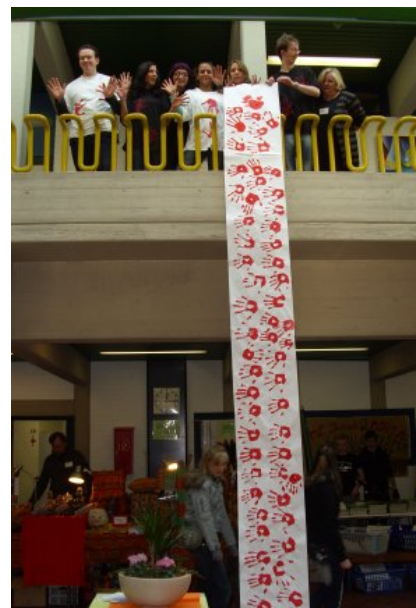
Students in Kleve, Germany display their banner of Red Hands.